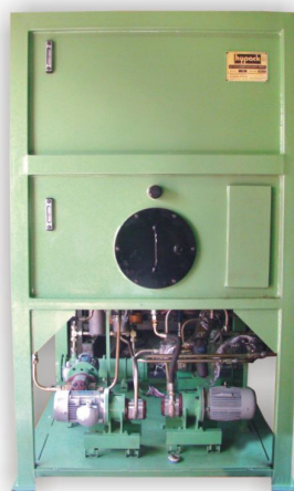
HYDRAULIC TEST RIG

We offer Pneumatic testing equipment and we design and also manufacture as per the specifications given by the customer.