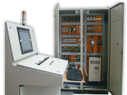
CONTROL SYSTEM FOR TEST RIG