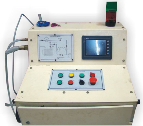
PNEUMATIC TEST RIG